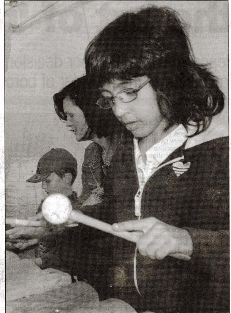
Harrow youngsters play musical instruments from around the world.

Call Harrow Museum about its events on 020 8863 6720.